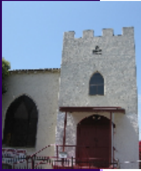
Former home of Ward AME Church 1250 E. 25th Street

My son, keep your father's commands, and don't forget your mother's teaching. Keep their words in mind forever as though you had them tied around your neck. They will guide you when you walk. They will guide you when you sleep. They will speak to you when you are awake. These commands are like a lamp; this teaching is like a light. And the correction that comes from them will help you have life.