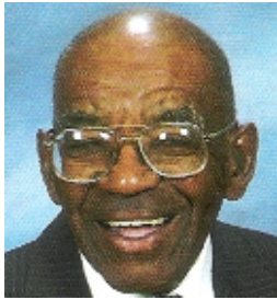
A native of Tree Rivers Michigan who attended Wilberforce University and Lincoln University School of Journalism in Jefferson City, MO, he co-founded the St. Louis Publishing Co.

As we celebrate the 107th anniversary of Ward AME Church, we recognize our long-standing members for their strong ability to remain steadfast.