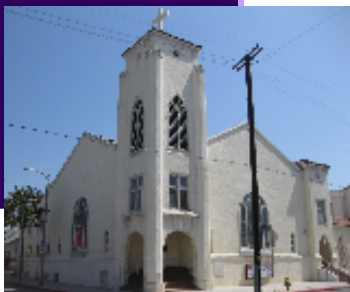
Current home of Ward AME Church 1177 W. 25th Street

Brothers and Sisters, Ward African Methodist Episcopal Church has been a guide for life for 107 years, and this is how it all started: